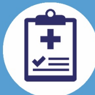
Emergency Contact List