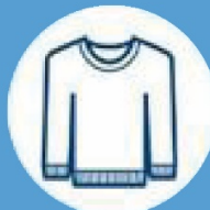
Warm Clothing + Blankets