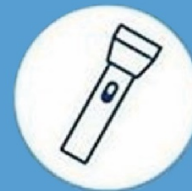
Flashlight + Extra Batteries